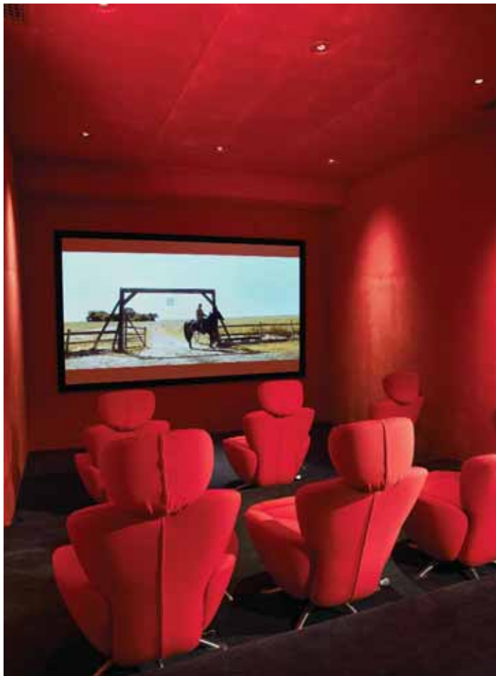
This page clockwise from top left: View to the terrace off the kitchen. The Gaming Salon with pool table and bar. Pool table by Blatt Billiards. Theatre down in the basement.