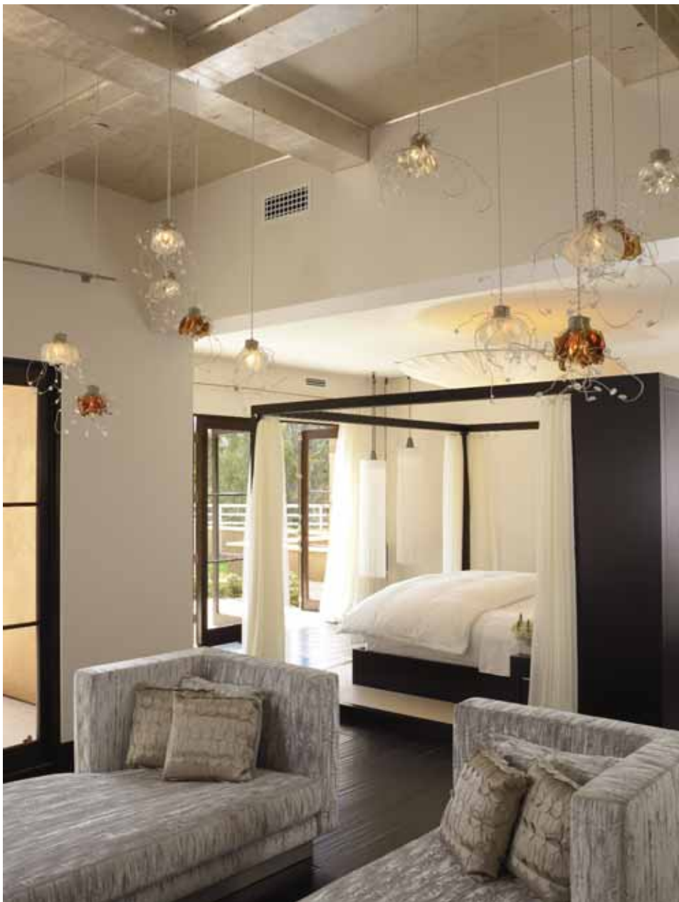
This page clockwise from top left: The master suite has a custom platform bed designed by Finley Design. Detail of the silver-leaf ceiling. The modern lines of the master bathroom complement the master bedroom. The backyard and patio with large oversized silver planters located off the master suite. Opposite page: A freestanding bathtub in the master bathroom.